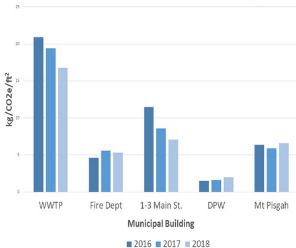
Total Green House Gas Emissions Intensity

The benchmarking data from 2016-2018 is summarized in the charts below. For a full report on Energy Performance Measures for Village Buildings, click HERE.